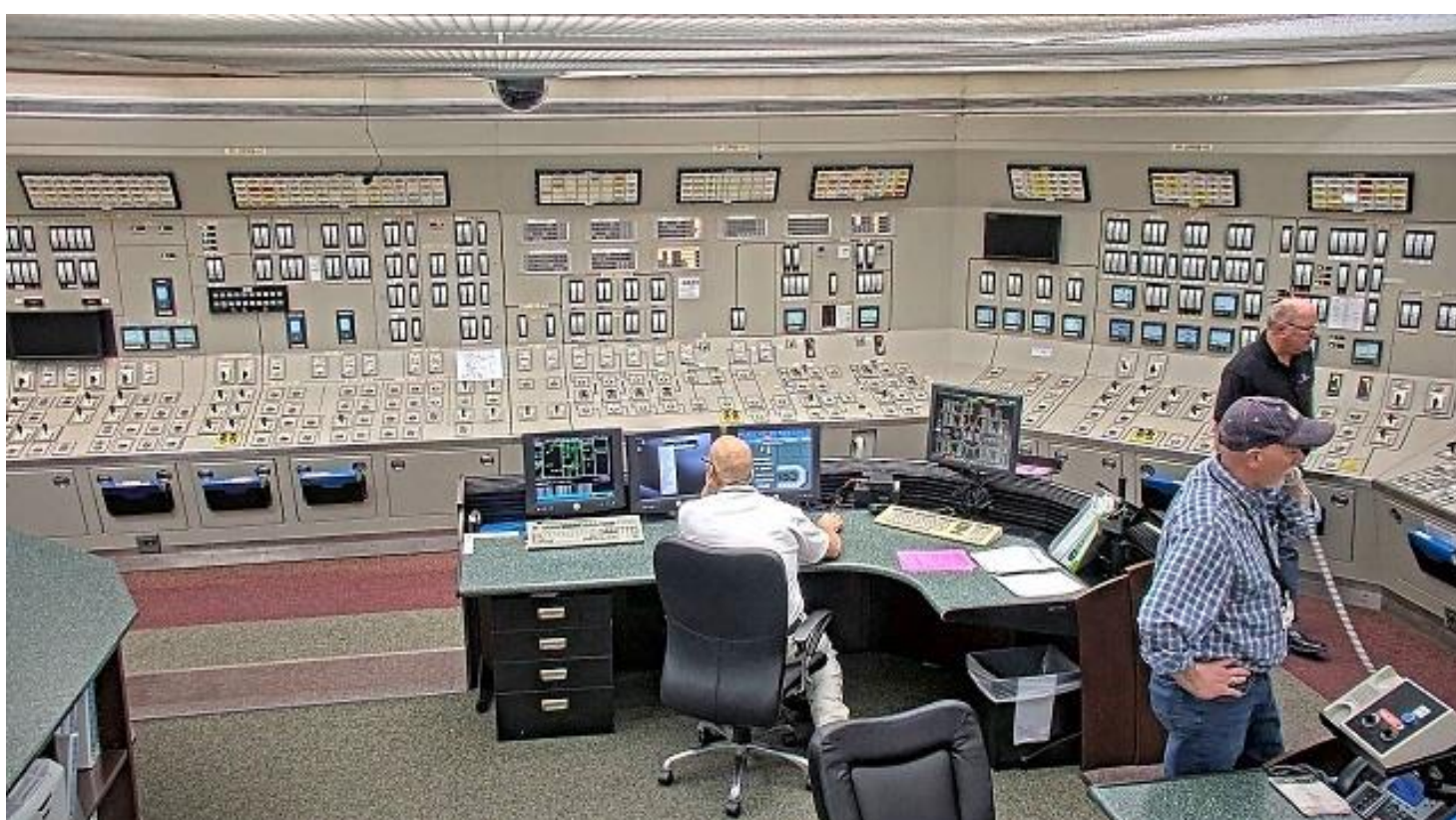
Image from recorded session during TEAMS acceptance testing at Comanche Peak

The user can play & pause, and easily select any specific time from a recorded scenario by dragging a slider, selecting from searchable lists of events, or clicking on trend plots. TEAMS immediately synchronizes all data sources to the selected time and is ready to play.