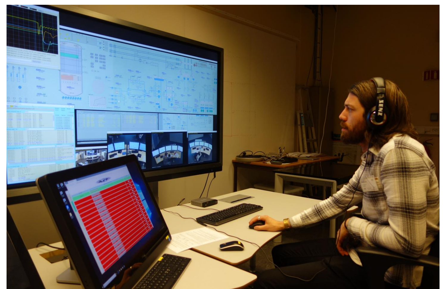
Operator using TEAMS during self-assessment after completing a simulator session